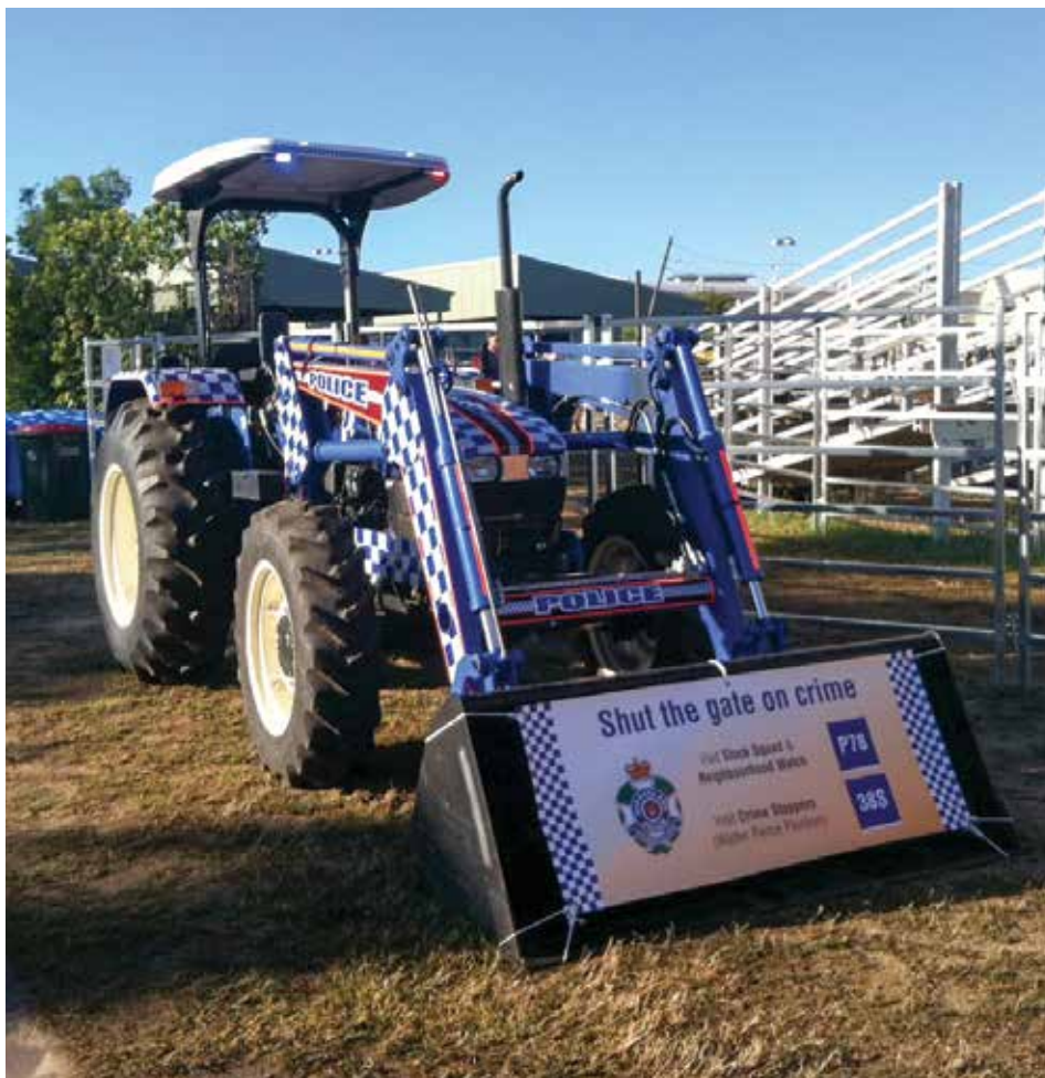
Trevor the Tractor sports police and SARCIS decals, thanks to the creative efforts of the Fleet Assets team at Alderley Depot.

The Stock and Rural Crime Investigation Squad (SARCIS), in partnership with Neighbourhood Watch, Policelink and Police Media, continues to push the boundaries to effectively engage with rural communities, promote crime prevention strategies and overcome the under-reporting of stock and rural crime.