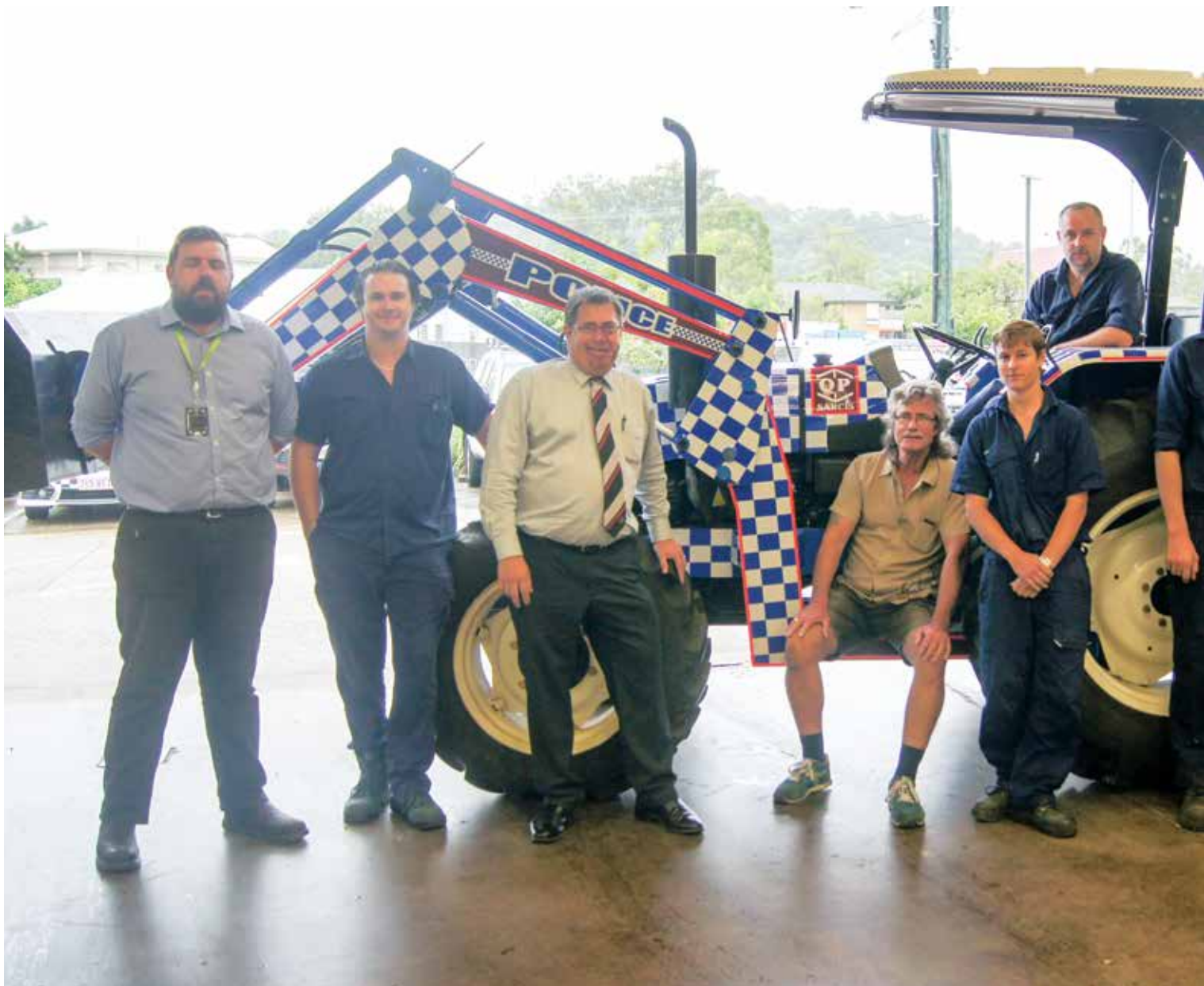
The combined SARCIS, Neighbourhood Watch and the District Crime Prevention Coordinators police site saw a constant stream of visitors during Beef Week at Rockhampton in May.