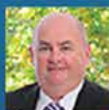
Cr Des Hudson South Ward Councillor, People and Communities Portfolio, City of Ballarat