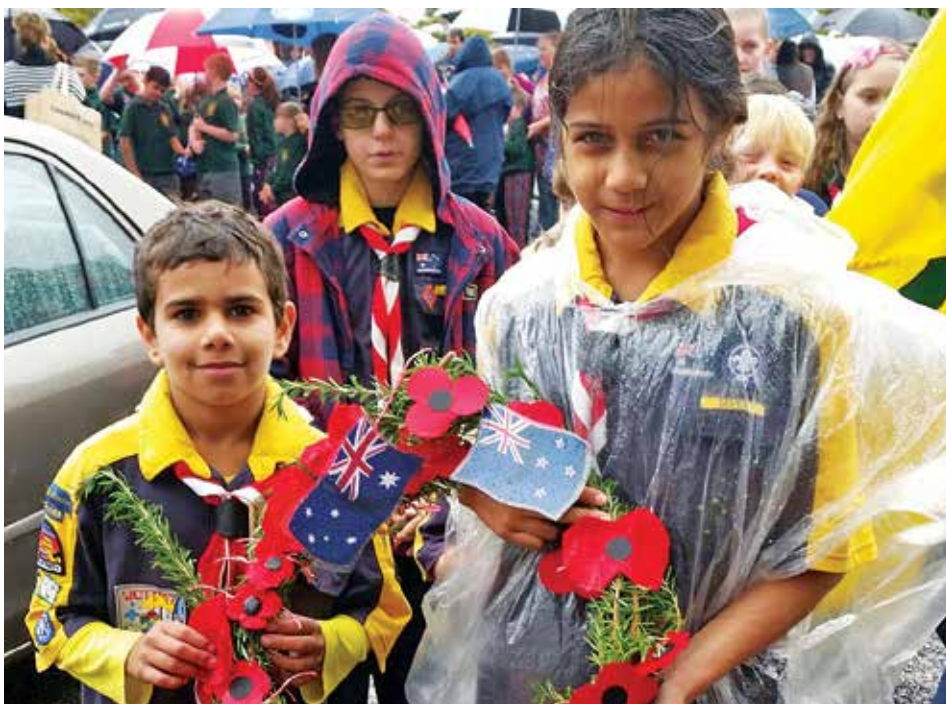
Koori Cubs at the Anzac Day Ceremony.

Word of this program has now circulated the town and there has